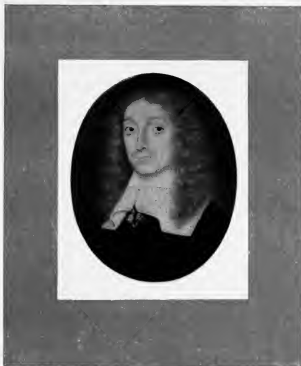
JOHN MILTON ARTIST UNKNOWN